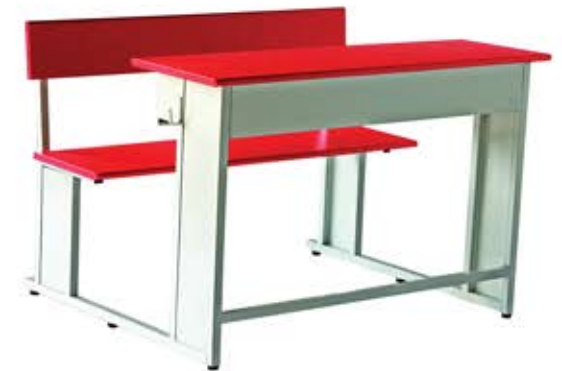
BRAINO - 2S

Top, seat & backrest : 18 mm thick-finger joint board-polished Frame : 25mm Sq. x 1.2mm thick M.S. tube-powder coated in blue shade Book shelf & modesty : 1mm thick M.S. sheet-powder coated in red shade