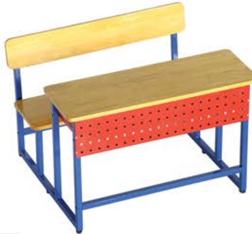
OPTIMO - 2S

Top, seat & backrest : 18mm thick-PLB & OSL-edge banded with PVC strip-bavarian beech shade Frame : 25mm Sq. x 1mm thick M.S. tube-powder coated in black shade Book shelf : 1mm thick M.S. sheet panel-3 sides covered-powder coated in black shade