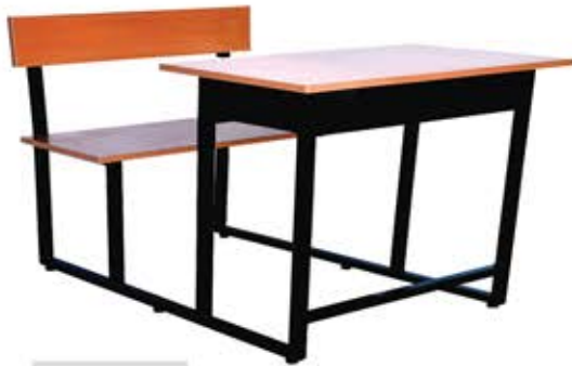
ECO - 2S

Top, seat & backrest : 18mm thick-PLB & OSL-edge banded with PVC strip-bavarian beech shade Frame : 25mm Sq. x 1mm thick M.S. tube-powder coated in black shade Book shelf : 1mm thick M.S. sheet panel-3 sides covered-powder coated in black shade